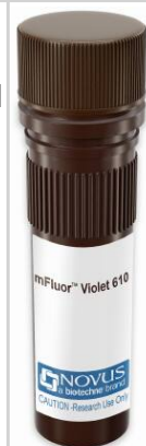
mFluor™ Violet 610

58K Golgi Protein Antibody (FTCD/357) [mFluor Violet 610 SE] [NBP3-14274MFV610] - Vial of mFluor Violet 610 conjugated antibody. mFluor Violet 610 is optimally excited at 421 nm by the Violet laser (405 nm) and has an emission maximum of 613 nm.