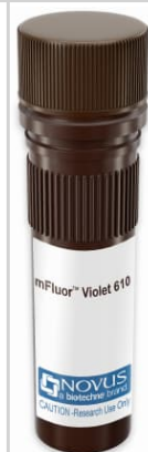
mFluor™ Violet 610

Cytokeratin 8/18 Antibody (KRT8.18/6579R) [mFluor Violet 610 SE] [NBP3-14099MFV610] - Vial of mFluor Violet 610 conjugated antibody. mFluor Violet 610 is optimally excited at 421 nm by the Violet laser (405 nm) and has an emission maximum of 613 nm.