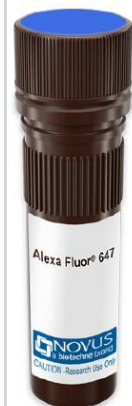
Alexa Fluor® 647

CD14 Antibody (LPSR/553) [Alexa Fluor® 647] [NBP2-47960AF647] - Vial of Alexa Fluor 647 conjugated antibody. Alexa Fluor 647 is optimally excited at 653 nm by the Red laser (633 or 640 nm) and has an emission maximum of 669 nm.