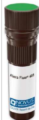
Alexa Fluor® 488

Product Image: CD14 Antibody (RPA-M1) [Alexa Fluor® 488] [NBP2-27215AF488] - Vial of Alexa Fluor 488 conjugated antibody. Alexa Fluor 488 is optimally excited at 490 nm by the Blue laser (488 nm) and has an emission maximum of 525 nm.