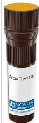
Alexa Fluor® 350

Glycophorin A Antibody (MM0314-7S41) [Alexa Fluor® 350] [NBP2-12339AF350] - Vial of Alexa Fluor 350 conjugated antibody. Alexa Fluor 350 is optimally excited at 346 nm by the UV laser (350 or 355 nm) and has an emission maximum of 442 nm.