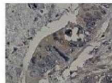
Sample: Human colorectal cancer

Immunohistochemistry-Paraffin: MMP-19 Antibody [NBP1-57092] - Control-Human small intestine, Sample-Human colorectal cancer, antibody concentration 2.5 ug/ml.