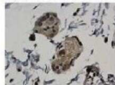
Control: Human Small Intestine

Immunohistochemistry-Paraffin: MMP-19 Antibody [NBP1-57092] - Human urinary bladder tissue, Ganglionic cells (Indicated with Arrows) 4- 8ug/ml.