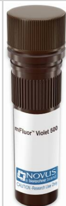
mFluor™ Violet 500

CD63 Antibody (MEM-259) [mFluor Violet 500 SE] - Vial of mFluor Violet 500 conjugated antibody. mFluor Violet 500 is optimally excited at 410 nm by the Violet laser (405 nm) and has an emission maximum of 501 nm.