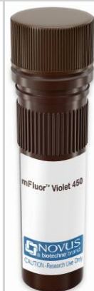
mFluor™ Violet 450

CD14 Antibody (M5E2) [mFluor Violet 450 SE] [NB100-77758MFV450] - Vial of mFluor Violet 450 conjugated antibody. mFluor Violet 450 is optimally excited at 406 nm by the Violet laser (405 nm) and has an emission maximum of 445 nm.