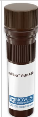
mFluor™ Violet 610

CD45 Antibody (YKIX716.13) [mFluor Violet 610 SE] [NB100-65906MFV610] - Vial of mFluor Violet 610 conjugated antibody. mFluor Violet 610 is optimally excited at 421 nm by the Violet laser (405 nm) and has an emission maximum of 613 nm.