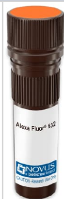
Alexa Fluor® 532

HLA-DR Antibody (37.68) [Alexa Fluor® 532] [NB100-65424AF532] - Vial of Alexa Fluor 532 conjugated antibody. Alexa Fluor 532 is optimally excited at 532 nm by the Yellow-Green laser (561 nm) and has an emission maximum of 554 nm.