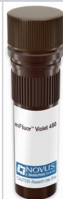
mFluor™ Violet 450

L-Selectin/CD62L Antibody (FMC46) [mFluor Violet 450 SE] [NB100-65388MFV450] - Vial of mFluor Violet 450 conjugated antibody. mFluor Violet 450 is optimally excited at 406 nm by the Violet laser (405 nm) and has an emission maximum of 445 nm.