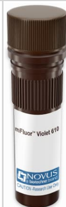
mFluor™ Violet 610

Integrin alpha 2b/CD41 Antibody (PM6/248) [mFluor Violet 610 SE] [NB100-63779MFV610] - Vial of mFluor Violet 610 conjugated antibody. mFluor Violet 610 is optimally excited at 421 nm by the Violet laser (405 nm) and has an emission maximum of 613 nm.