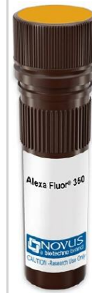
Alexa Fluor® 350

Neutrophil Elastase/ELA2 Antibody (950334) [Alexa Fluor® 350] [MAB9167AF350] - Vial of Alexa Fluor 350 conjugated antibody. Alexa Fluor 350 is optimally excited at 346 nm by the UV laser (350 or 355 nm) and has an emission maximum of 442 nm.