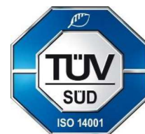
Michael Fernald Head of Central Certification Body Page 1 of 2

The certificate is valid from January 22, 2024 until January 21, 2027 With a re-issue date on June 21, 2024